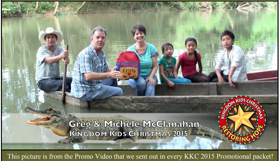
This picture is from the Promo Video that we sent out in every KKC 2015 Promotional packet!

If you have received the “Kingdom Kids Christmas Promotional Packet” please start promoting now!! We only have 6,000 of the 20,000 backpacks sponsored!